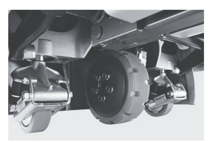
Profiled drive wheel