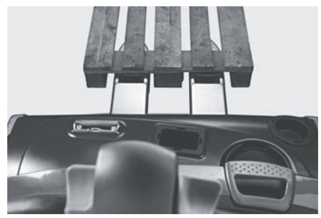
View on tip of forks