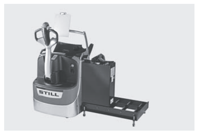
Lateral battery change