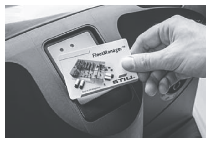
Access authorisation FleetManager 4.x