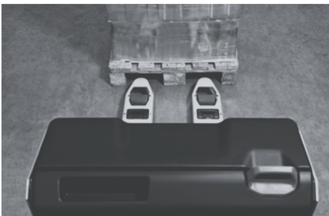
Free view on forks